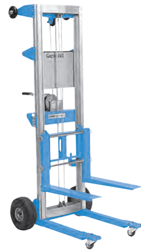
(1) Available aftermarket only